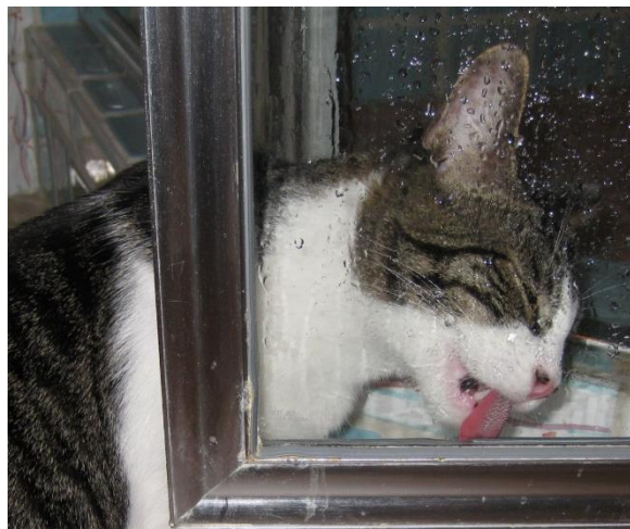
A fat cat can lap.