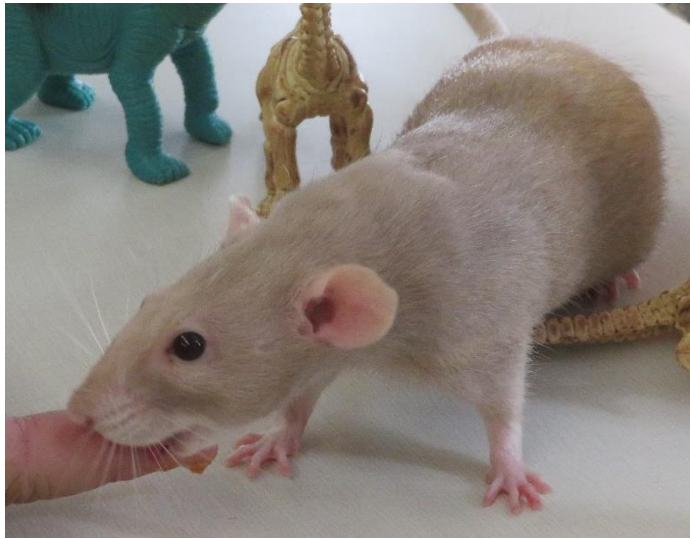
A fat rat can lap.