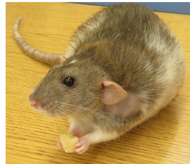
A fat rat sat on a mat.