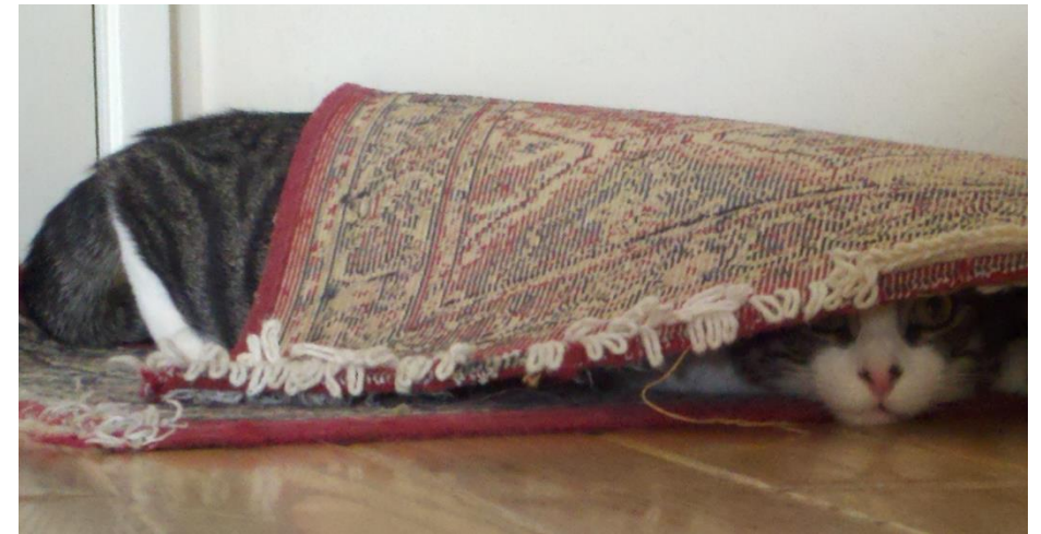
A fat cat sat on a mat.